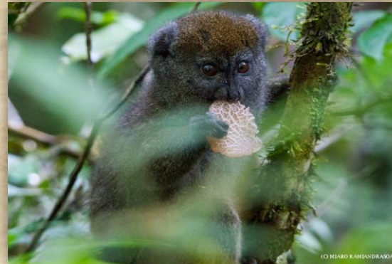
Eastern Lesser Bamboo Lemur