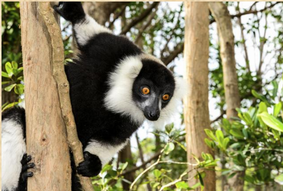
https://www.ecoheros.ca/blogue_sauvage/super-heros-pollinisateurs/le-top-10-des-pollinisateurs-les-plus-cool-2/ Black-and-white Ruffed Lemur