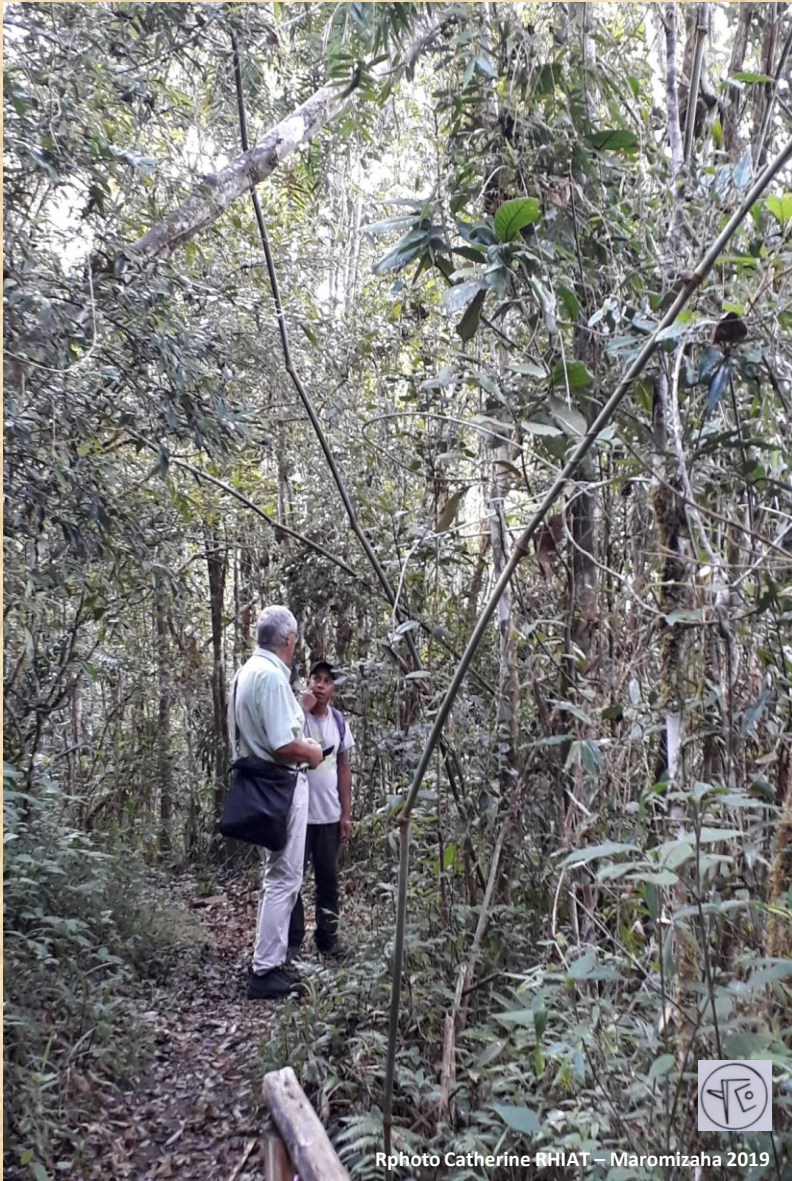
Maromizaha 2019