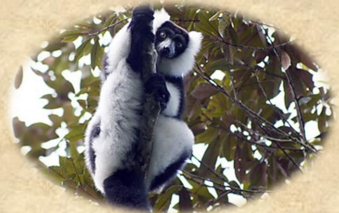
Black-and-white Ruffed Lemur

On this island, many animals and plants species have developed..