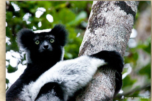
Indri