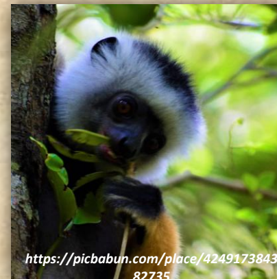
Diademed Sifaka