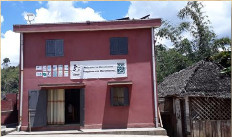
Maromizaha 2019