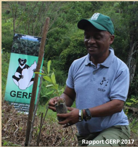
Rapport GERP 2017

For the greater good of future generations, they replant many endemic trees on cleared areas.